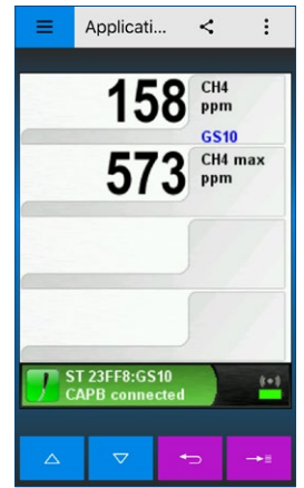
Example for measurement on EuroSoft live app