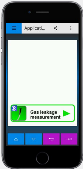
Example on your Smartphone