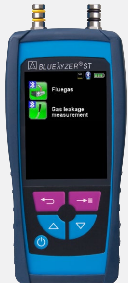
Example on our BLUELYZER ST